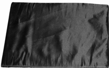
Reinforcement Board- already installed in unit.